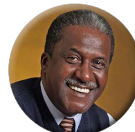
Rawn Harbor Liturgist

Conference Registration. Conference Registration is $200, which includes conference materials, four (4) meals, and a conference shirt. Registration fees must be received or postmarked by June 15, 2020. Registrations received after June 15 will be considered on-site registrations with no guarantee of meals. Note: Group rates are not available. There will be a $35 returned check fee.